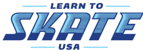
ILLUSTRATION OF THE PROGRESSION THROUGH THE LEVELS OF U.S FIGURE SKATING

Singles athletes begin with the Learn to Skate USA program, then progress to the "introductory levels," and finally choose whether to follow the test track or Well Balanced program category.